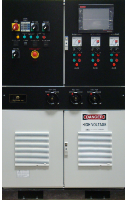
*NOTE: IMAGES MAY DIFFER FROM ACTUAL UNIT.